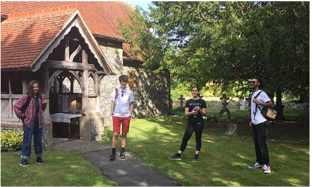
The Churn Benefice Youth Group – socially distanced but having a good time

letter from our Chairman together with the information about Ride+Stride. The feedback has been so positive we have done the same this year.