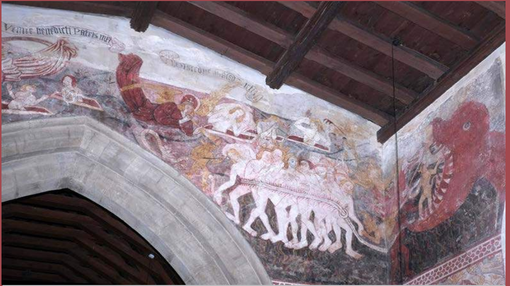
The Last Trump (15C, restored 1872): South Leigh, St James the Great

[Front cover: Ducklington, St Bartholomew]