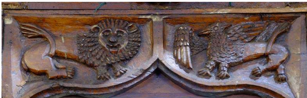
16/17th-century carving in the screen, All Saints, Wroxton