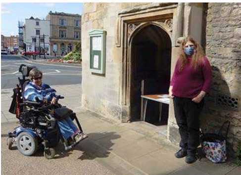
A Ride+Strider being welcomed at St Nicholas' church on Abingdon market place.

As the Annual Review goes to press we are planning our 2021 Ride+Stride reflecting some of the simplified procedures learnt in 2020. Many thanks to everyone for their support in past years: we are looking forward to your involvement again in 2021.