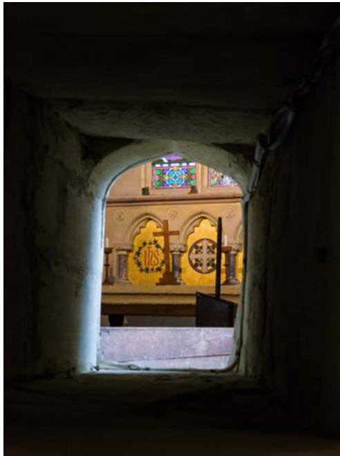
Through the squint at Alvescot

At St Mary the Virgin, Buckland, we heard about a massive project of restoration and improvements which had recently been completed. St Mary's dates from the 12 th century, but it boasts an abundance of fine 19 th - and 20 th -century stained glass (see the back cover) and mosaics.