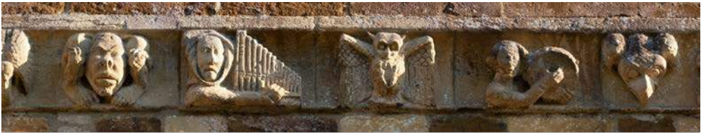
Adderbury, St Mary (Grade I listed) Awarded £26,000 for new electrical heaters

Please contact chair@ohct.org.uk for more information.