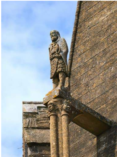
St John the Baptist on Witney spire

St Peter's, Alvescot, had only just reopened after some serious engineering work to its roof. Both these two churches had received grants from the Trust.