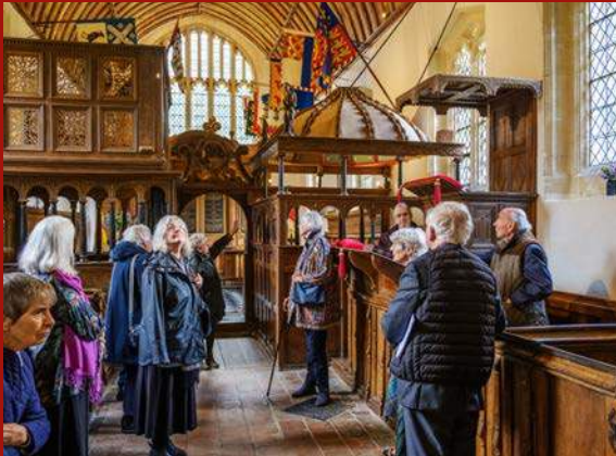
Members of the Trust being shown the interior of the 15C chapel at Rycote with its finely carved early 17C stalls