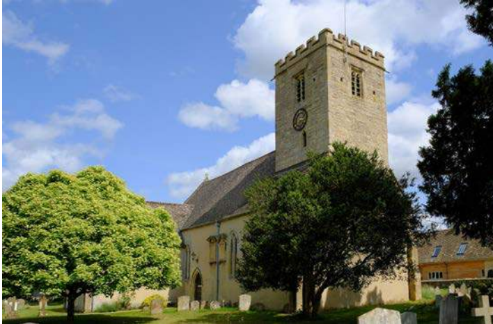
St Denys' Northmoor (Grade-I listed)