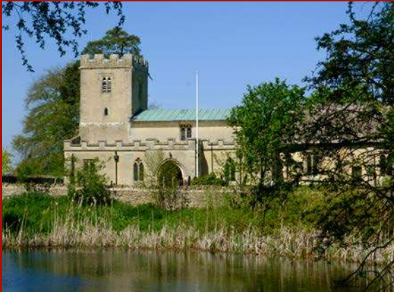
Longworth, St Mary (Grade-I listed)

The Trust has had another busy year providing grants to the county's churches: according to our constitution, our role is to work for the benefit of both local communities and the wider public, to preserve and enhance Oxfordshire's historic churches used for public worship and their associated structures and contents. We provide financial help for the repair and practical enhancement of churches, chapels, and meeting houses in Oxfordshire regardless of denomination and including buildings dating from Saxon and Norman times through to the twentieth century.