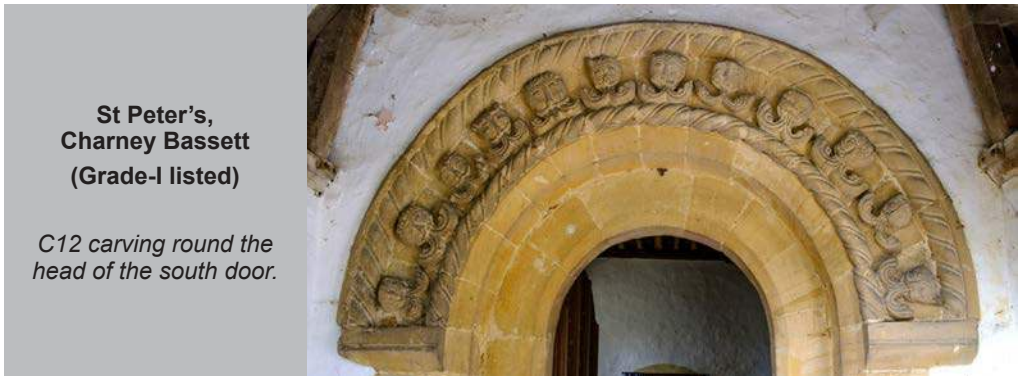
St Peter's, Charney Bassett (Grade-I listed)

After an excellent lunch at The Plough, West Hanney, our next stop was the small chapel of St Mary the Virgin at Lyford, modest and rubble-built, with a timber bell turret. We heard about its connections with the Yates, a local recusant family, and the arrest nearby of Edmund Campion and his Jesuit friends – the chapel is now a pilgrimage site commemorating his martyrdom. It also has two moving memorials to a local young man lost to a torpedo in the Dardenelles and to the crew of a WWII bomber which crashed nearby.