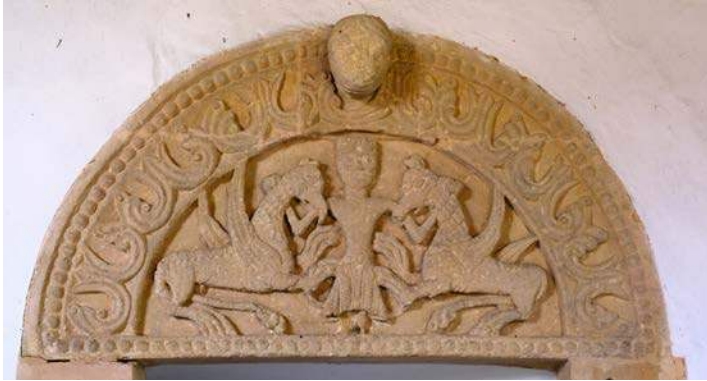
St Peter's, Charney Bassett (Grade-I listed)

St James the Great, West Hanney, has a tall, narrow Norman nave and a late C12 bell tower over the North transept. It has a Norman font and an Early English chancel arch with finely carved stone capitals.