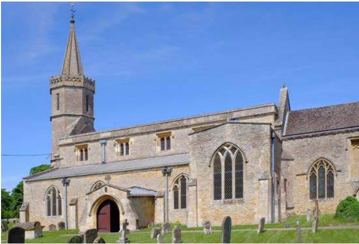
St Giles', Standlake (Grade-II* listed) C12 and later

Having started at St Giles', Standlake, with its distinctive octagonal tower, fine carved corbels and a Victorian roof with beautiful wooden angels holding Signs of the Passion, we moved to St Michael's Stanton Harcourt. This is a veritable treasure house with a rare mid-C13 chancel screen, some early medieval glass fragments, the C13 Shrine of St Edburg, and the spectacular Harcourt Chapel with its many memorials, including two tombs displaying handsome effigies of knights (late C14 and early C15), and the standard borne for Henry VII at Bosworth Field.